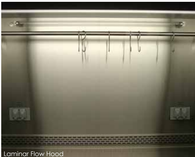
Laminar Flow Hood