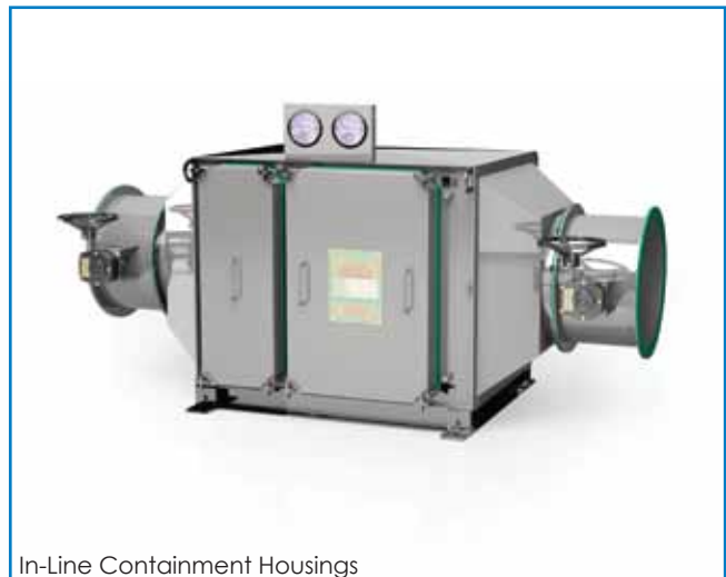
In-Line Containment Housings