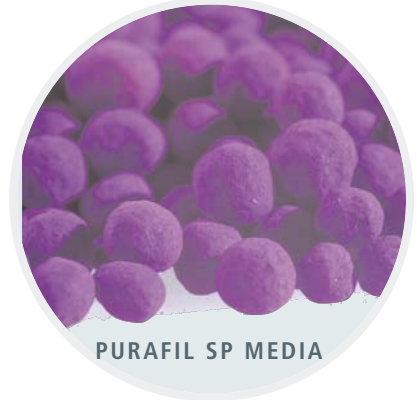
PURAFIL SP MEDIA

PURAFIL SP MEDIA demonstrate a higher working capacity for broad-spectrum oxidation of contaminants in actual field condition, where multiple gas challenges are present. The Purafil SP Series has been specially engineered to contain more permanganate (the active ingredient) for increased removal capacity, allowing the media to remain more available for removal of target gases.